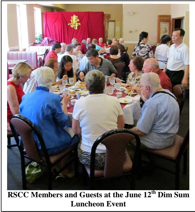
RSCC Members and Guests at the June 12 th Dim Sum Luncheon Event

The Rockville Sister City Corporation (RSCC) will be participating in the World of Montgomery Festival next month. The half-day event will be in Wheaton on October 16 th , 2011, and it will run from