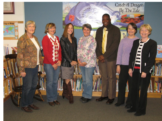
Photo: Beall Elementary School visit