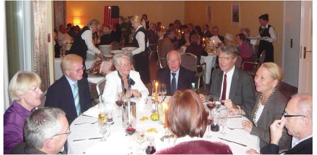
Photo: Thanksgiving dinner, Pinneberg

anticipated by the members of the German American Society Rockville-Pinneberg. Last year about sixty people signed up and about half of them were newcomers.