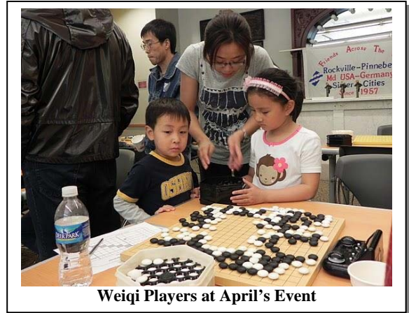
Weiqi Players at April's Event