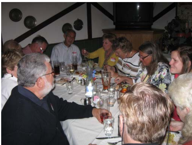
Diners enjoying themselves at RSCC's 2010 German-American Day Dinner

RSCC held its second annual German-American Day dinner at the Old Europe Restaurant on Wisconsin Avenue in the District on Sunday, October 3 rd , 2010. Forty-five members and guests attended and enjoyed the Oktoberfest buffet menu and geniality—or, what German speakers refer to as Gemütlichkeit . RSCC held a raffle with numerous prizes donated by members, Frames by James, Strathmore Music Center, etc., which raised significant funds to support our programs.